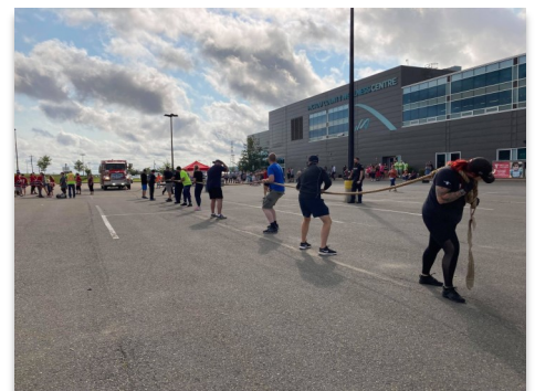
Stellarton Police placed 2nd in the United Way of Pictou County's Pull for Change