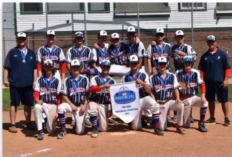
Pictou County Highlanders Provincial Champions