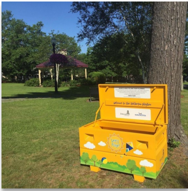
The Community PlayBox installed at Allan Park