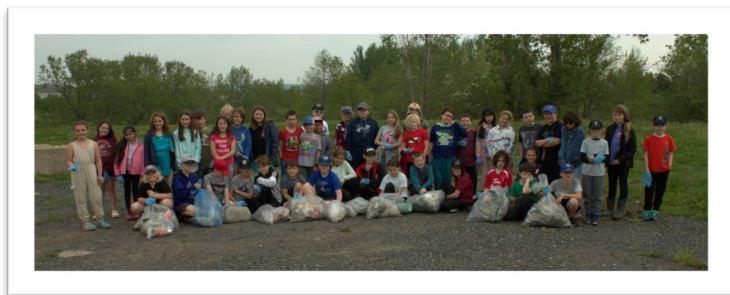
Grade 4’s from G.R. Saunders participated in the school’s annual community cleanup at the Foster Avenue Park.