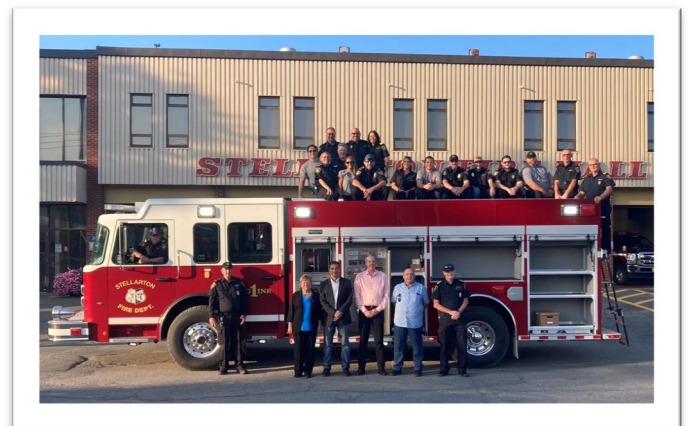
Stellarton Fire Department and the new fire truck purchased by Council.