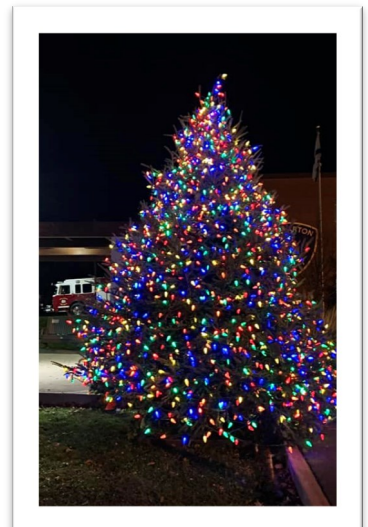
The largest tree Stellarton has had in Town Square.