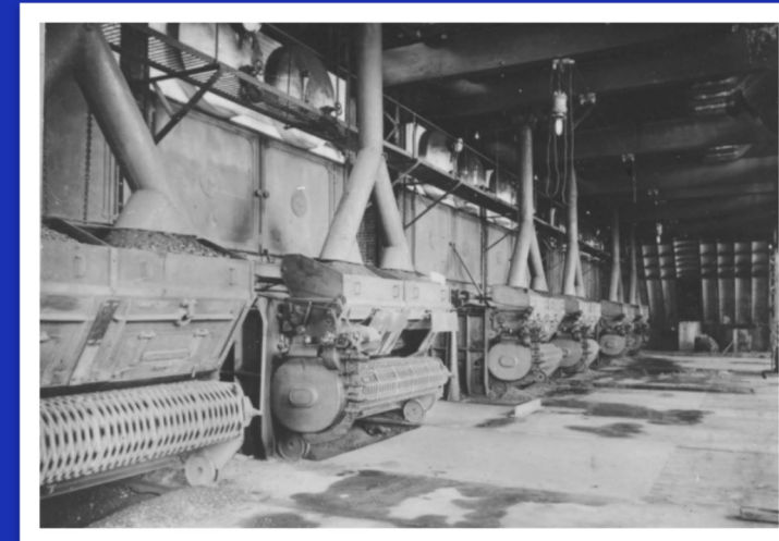
"Interior of the Allan Shaft electric generating plant, Stellarton, NS"